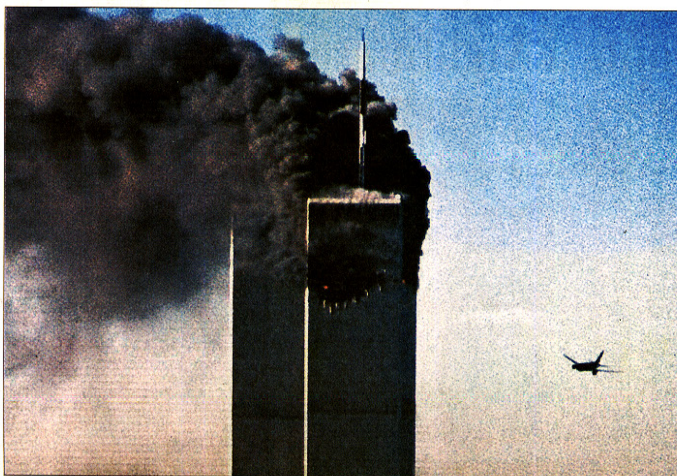
Minutes after an American Airlines plane crashed into the World Trade Center in New York City, a United airliner is about to hit the complex.

Originally headed for Los Angeles, the American Airlines Boeing 757—carrying 64 people and loaded with 30,000 pounds of fuel for the long flight to the West Coast—