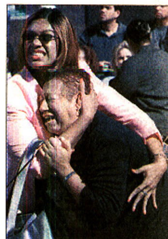
Two women hold each other as they watch the World Trade Center burn.

Where we stood there now came a roiling cloud—smoke and ash, ten stories tall, building speed as they reached the canyons of Manhattan's southern tip. Survivors streamed, choked and gagging, behind the cloud. Among them, stumbling